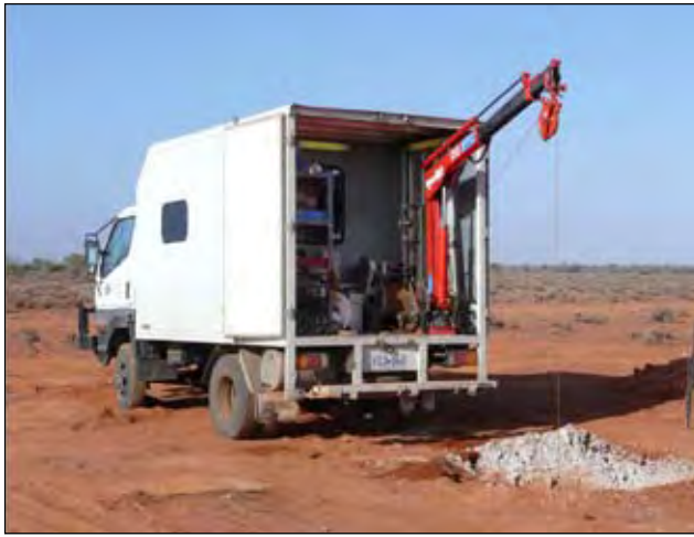
Temperature logging in progress at Frome 9 drillhole

deepening to over 1,000 metres, which is scheduled for early in the New Year. The objective will be to confirm that temperature gradients indicated from the shallower drilling continue to depth in order to provide confidence for drilling a deep test hole into the geothermal reservoir at 3-4 km depth.