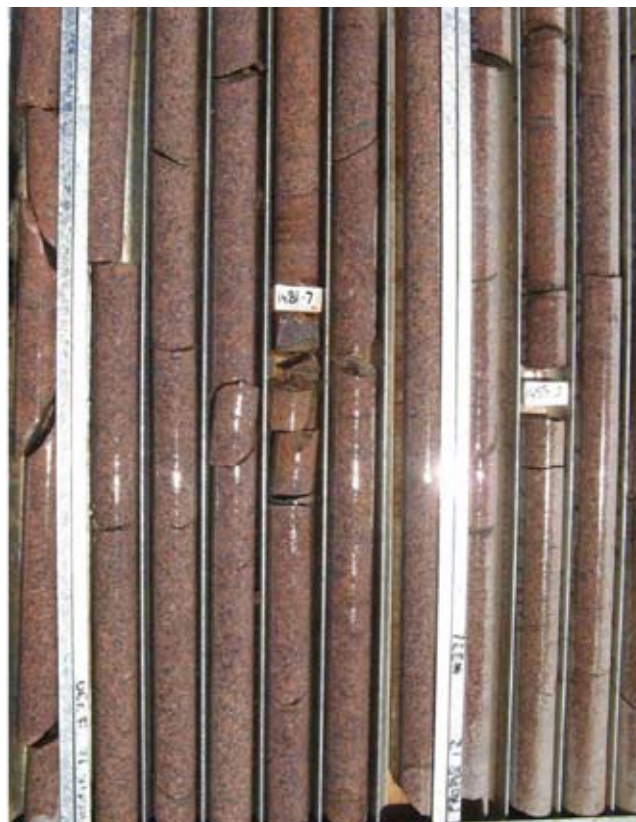
Granite in drillcore from 1477 to 1486.7 metres depth in Frome 12. Note subhorizontal fractures (almost at right angles to the vertical drill core).

From the Frome 12 drilling results it is now apparent that the upper part of the granite body also gives strong seismic reflections just like the layered sediments. Continued drilling into the granite is expected to elucidate why the granite is seismically reflective. Observation of drillcore shows appreciable sub-horizontal fracturing and foliation in the granite, which may be causing the seismic reflections and hence the layering effect (see core photograph). If so, then it appears that the upper 1.5 km of the granite is likely to be extensively horizontally fractured, which is extremely positive for the occurrence of a hot fractured rock geothermal reservoir.